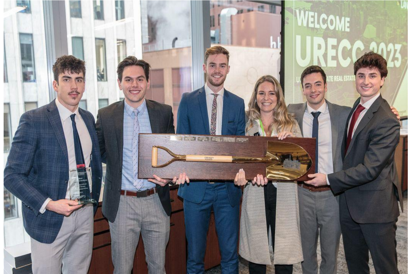
The 2023 Golden Shovel Recipients from the University of Guelph (Tri-City Capital)

The 2023 competition was our first in-person event since 2019. Despite the challenge of coming back from an online setting, we continued to attract a large number of international delegates. This included several teams from across North America. The 2023 first place award was presented to the Tri-City Capital team.